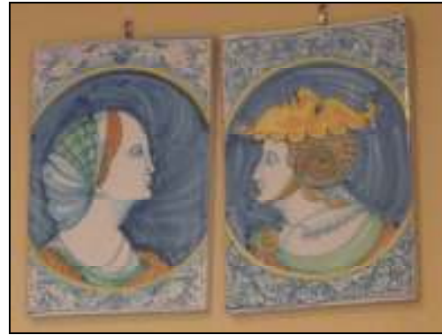
PAINTED CERAMIC TILES