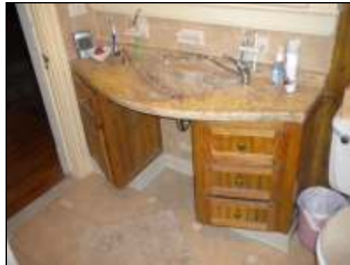
HAND MADE VANITES AND FIXTURES