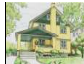
A UNIQUE GIFT BY TOUCH OF DISTINCTION