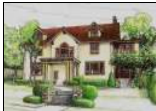
COLOR OR BLACK AND WHITE RENDERINGS