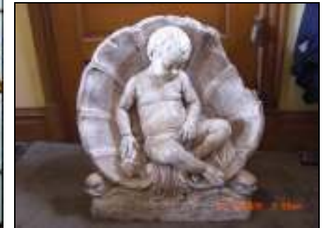
UNIQUE PLASTER DECORATIONS