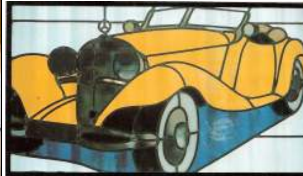
STAINED GLASS CUSTOM MADE FOR YOUR HOME